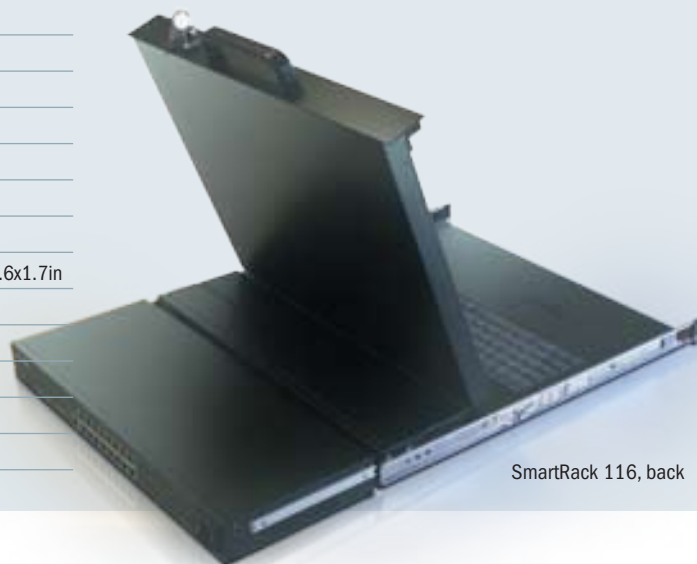
SmartRack 116, back