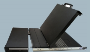
Detached Switch 232